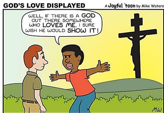
But God demonstrates his own love for us in this: While we were still sinners, Christ died for us. - ROMANS 5:8 NIV

Most Blessed Lord, guide our wandering feet, we beseech Thee, into the love of God and into Thine own infinite patience. Forgive us that we have so often been impulsive and headstrong, that we have murmured against Thy apparent slowness in answering our prayers. Hush our unquiet hearts with Thine own peace. AMEN.